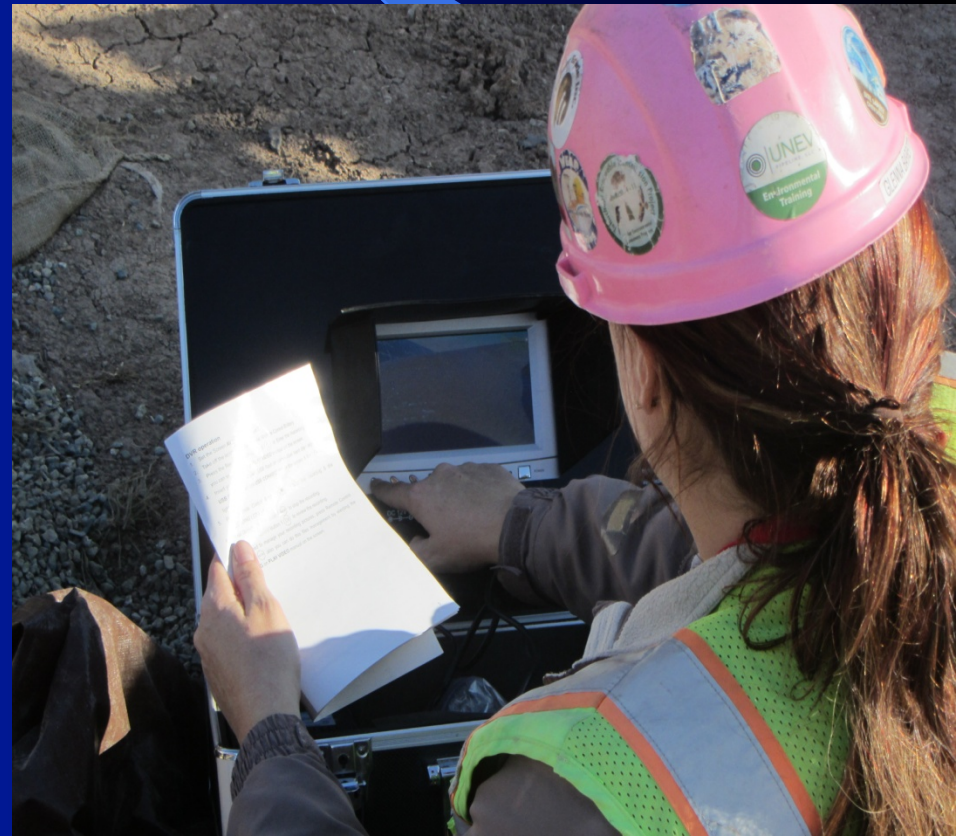
VIDEO SNAKE VIDEO SCREEN