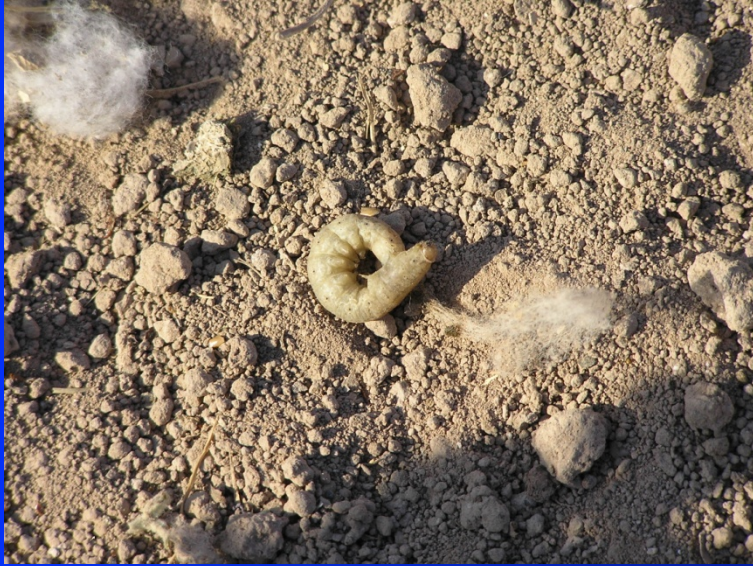
LARVAE LEFT AT BURROW