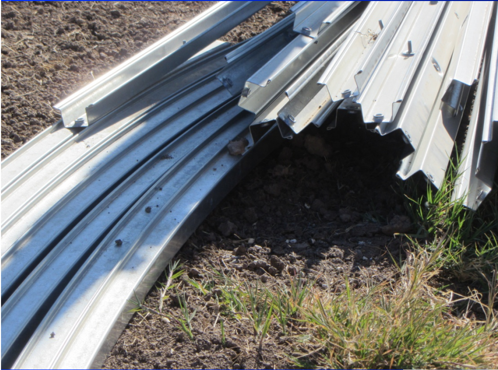
SMALL BURROW IN PIPE PILE