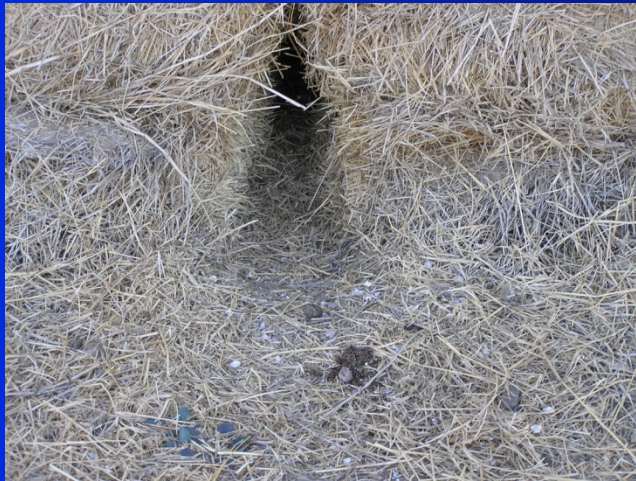
BURROW IN HAYSTACK