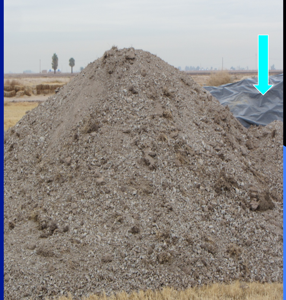
RECYCLING CONCRETE; LARGE CHUNKS TARPED