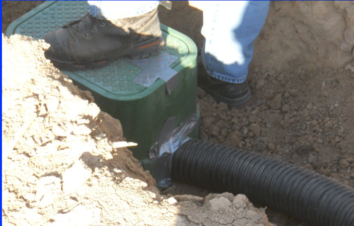
Secure pipe and block holes with duct tape