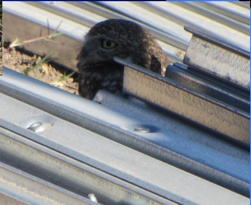
BUOW IN PIPE