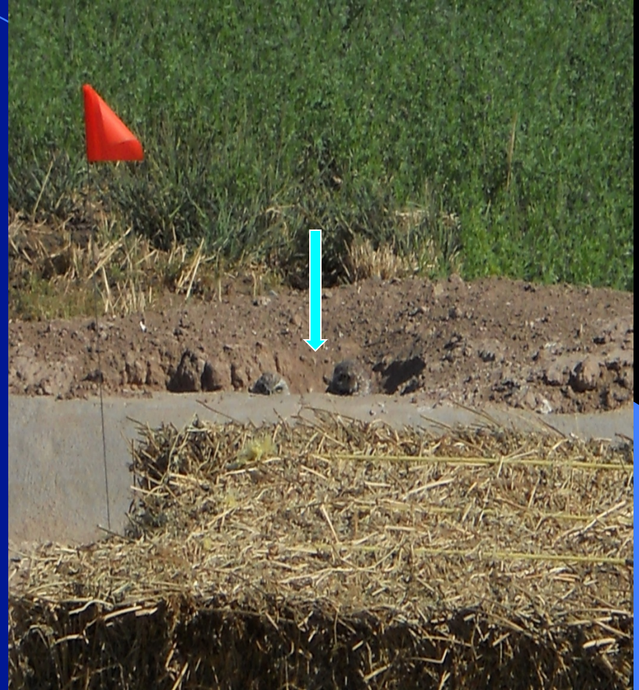
OWLS BEHIND SHELTERS DURING ROAD CONSTRUCTION