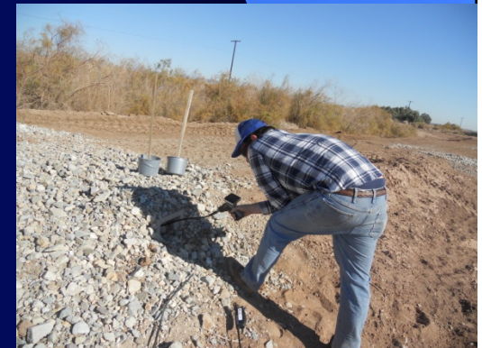
Probing to be sure of alignment