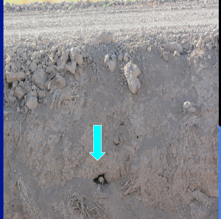
IID Drain Ditch