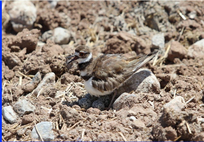
KILLDEER WITH 4 EGGS