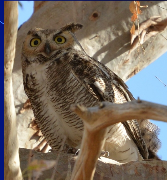
Great horned owl and nest