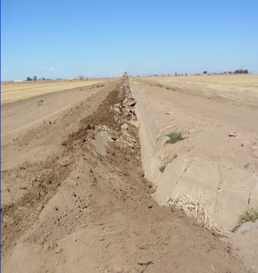
CONCRETE DITCH REMOVAL