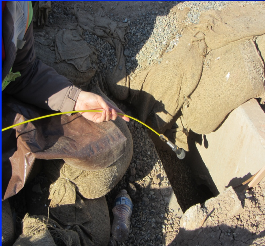
VIDEO SNAKE CAMERA AND CABLE